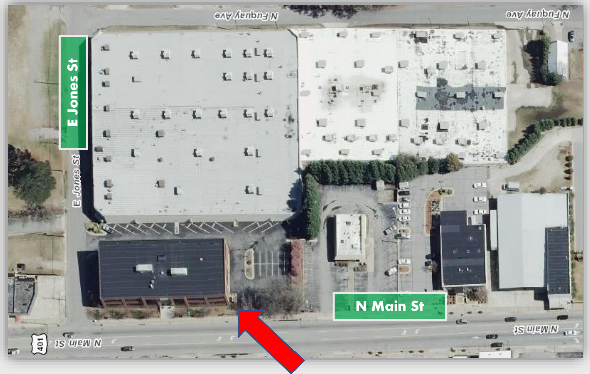
Bob Barker Company Office Building (Future Town Hall Building)

401 Old Honeycutt Road 14,200 SF – 5.92 Acres