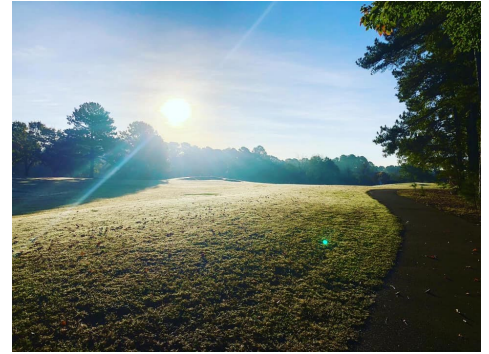
The sun sets at one of the trails at HNTPP located at 4621 Shady Greens Drive.

Hilltop Needmore Town Park & Preserve (HNTPP), a 164-acre passive-use park containing five miles of paved walking trails for public use, opened in early February and has been very popular and well utilized ever since. In fact, more than 300 people were in attendance to celebrate the park on opening day!