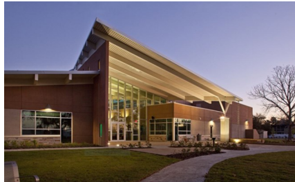
This rendering is for illustrative purposes only.

The Town of Fuquay-Varina is excited to announce the design of the Community Center North/Senior Center is in the preliminary stage! We are beginning the process of gaining input in the consideration of various components and amenities for future design and the eventual construction to be