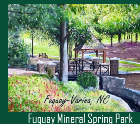
Fuquay-Varina, NC Fuquay Mineral Spring Park